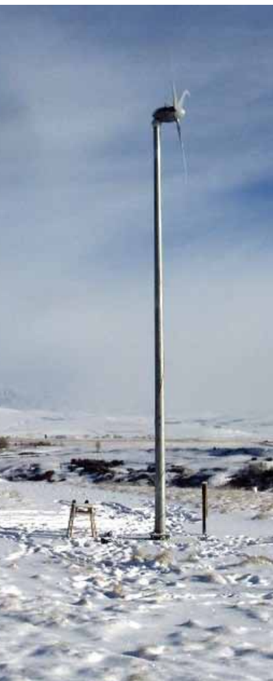
SOUTHWEST WIND POWER

"The investment to hook your technology into our system is as low as its likely going to get."