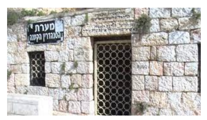
The Tomb of Simeon the Righteous ... chabad.org

In 1875, Two Jewish Religious Trusts Purchased the Shimon HaTzaddik Tomb and Surrounding Land: For centuries, Jews made pilgrimages to pray at the tomb of beloved 4th century BCE Kohen Gadol (high priest) Shimon HaTzadik (Simeon the Just), in Jerusalem, northeast of the Old City. In 1875, two Jewish trusts, the Sephardi Community Council and the (Ashkenazi) General Council of the Congregation of Israel (a.k.a the "General Committee of the Knesset of Israel"), purchased the tomb and nearby lands forming the "Shimon HaTzadik" and "Nahalat [Inheritance of] Shimon" neighborhoods. Palestine Chief Rabbi Avraham Ashkenazi and Jerusalem Chief Rabbi Meir Auerbach registered the property in the Ottoman land registry in 1875 and 1876. Dozens of poor Jewish families moved there and continued to live there.