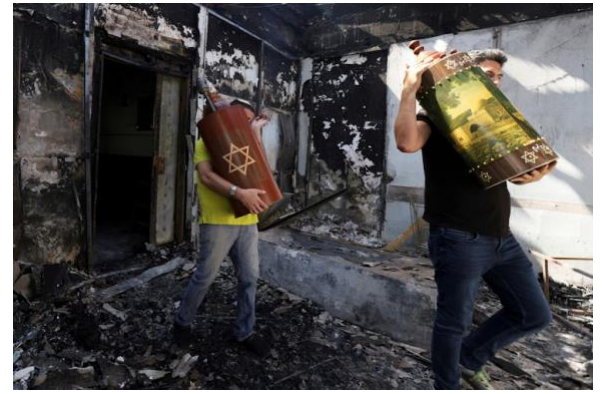
Torah scrolls saved from a synagogue torched by Arab rioters in Lod, Israel, May 12, 2021 (above). Car burned by Arab mobs in Lod, Israel, May 2021 (below).