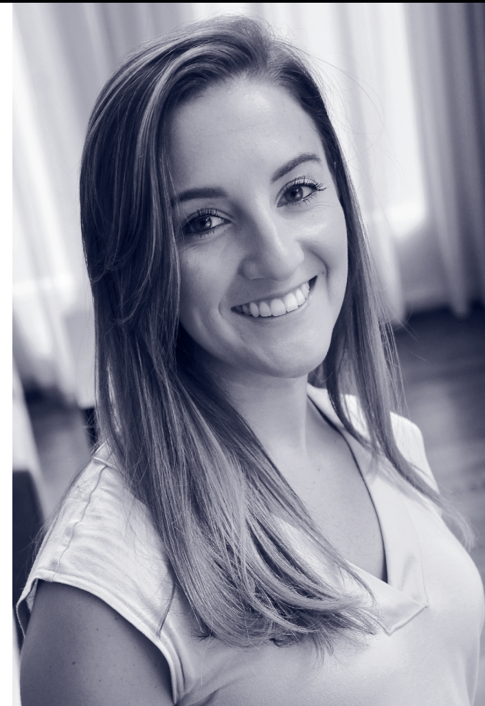
Chart Your Path.

“The Public Interest Scholars Program drew me to Villanova, but I had no idea how to make a legal career out of my desire to serve others. My career adviser and faculty adviser were instrumental in helping me develop that path by offering advice on coursework and externships, job networking and interviews. Working for Villanova Law’s Civil Justice Clinic and the Defender Association of Philadelphia made clear that I love being in court and interacting with clients. I now know that I want to work at the intersection of public defense and child welfare, and next year I’ll be clerking for a judge in the Family Division in New Jersey.”