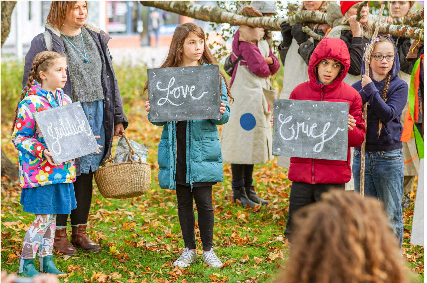
Walking Forest, Coventry City of Culture 2021.