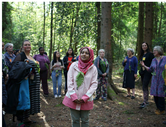
Walking Forest, Rough Close Camp, May 2021.

A 10-year artwork taking place in sites across the UK exploring links with activism, natural forest networks and communities. The commission involved a camp for Coventry women to learn from women earth defenders globally and a public procession through the city.