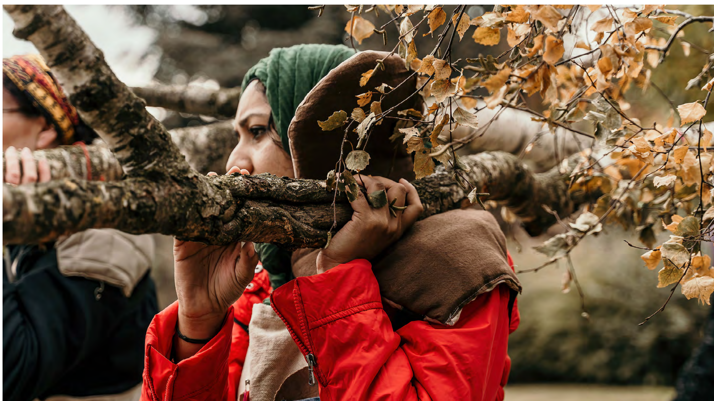
Walking Forest, Coventry City of Culture 2021.