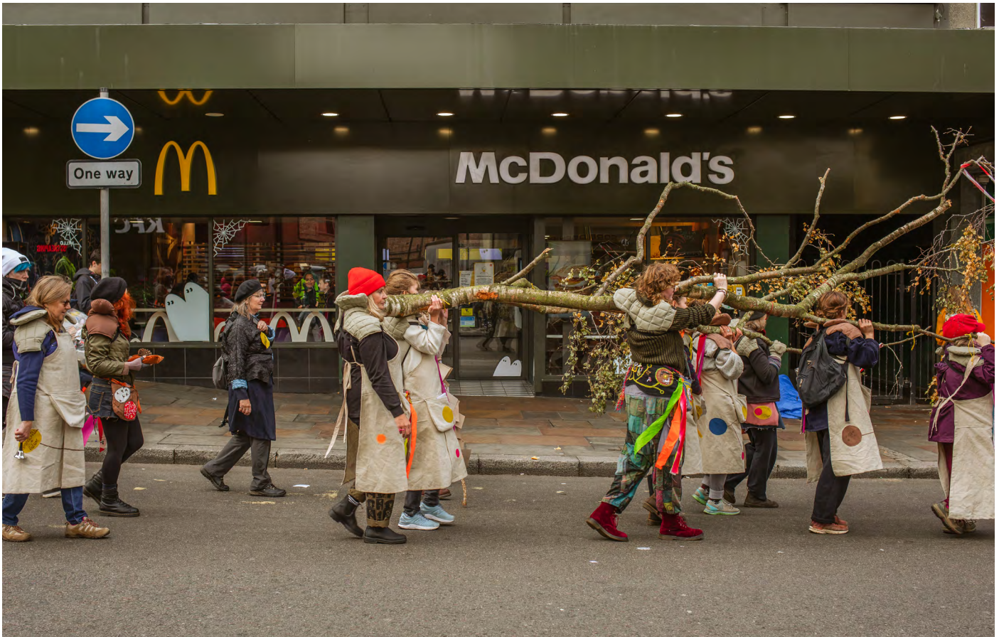
Walking Forest, Coventry City of Culture 2021