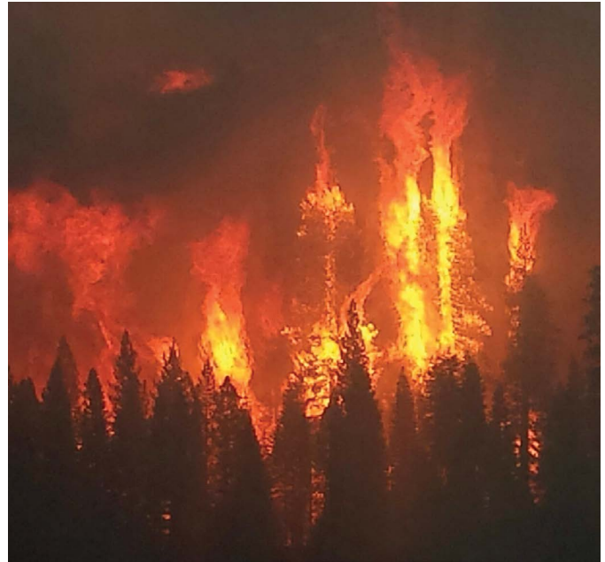
Canopy fire during the King Fire of 2014. Canopy fires occur when there are lots of ladder fuels that allow the fire to travel into the canopy. Canopy fires can be extremely hot and lead to widespread tree mortality.

We know how to manage forests so they are less prone to large, severe wildfires and drought and to decrease likelihood of large tree mortality events from insect and disease outbreaks. 9,10,20,21 Through use of targeted ecological thinning, prescribed fire, and managed wildfire we can reduce the accumulated high fuel loads, promote healthier, more resilient forests, reduce the risk of high-severity wildfire at large spatial scales, and protect sensitive species. Unfortunately, the pace and scale of these activities is inadequate given the widespread scope and long-term consequences of the problem.