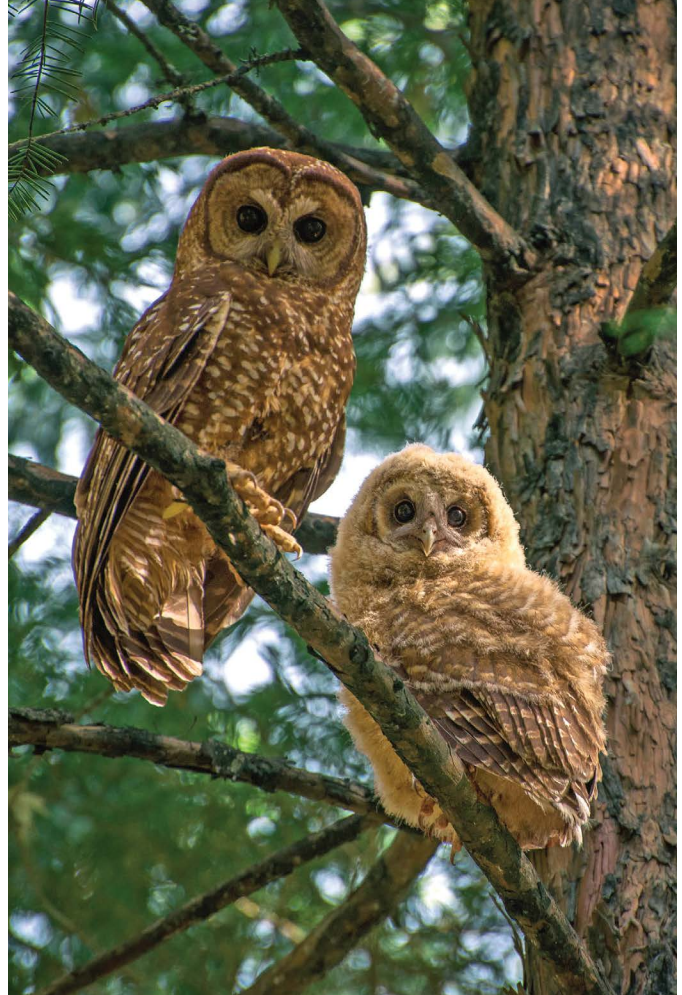
California spotted owl parent and chick newly out of the nest. Spotted owl populations have declined following early logging that removed most of the large, old tree habitat they need for nesting. Now, those that remain are increasingly threatened by high severity fires that can remove or significantly degrade their remaining habitat.

Given that our fire-adapted forests need more of the right kind of fire, but existing conditions and a warming climate make it unsafe for people and nature to allow all fires to burn under unmanaged conditions, what is the solution?