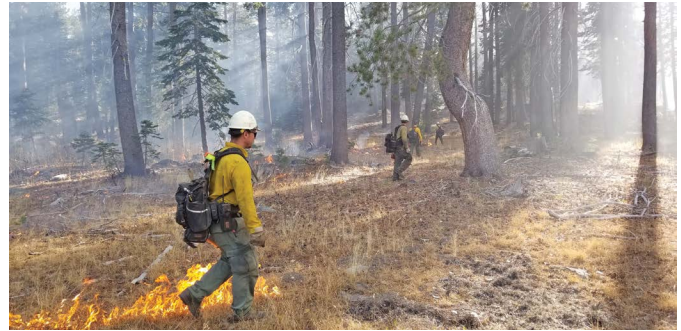
Crew working to implement a prescribed fire at The Nature Conservancy's Independence Lake Preserve following ecological thinning.

There could also be important indirect benefits of ecological forestry to people other than safety. Lower severity fires (including prescribed fires and managed wildfires) can have lower emissions per fire event