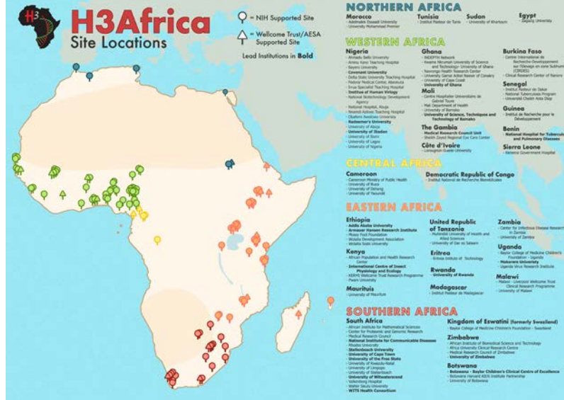
The H3Africa consortium has sites in 30 countries spanning the continent