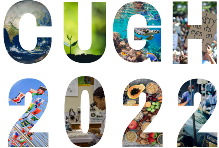
The theme of the 2022 conference was “Healthy People, Healthy Planet, Social Justice”

Corruption tips the scales in favor of the politically connected and the wealthy, noted Madonsela, recalling the looting of pandemic resources in developing nations and the hoarding and exorbitant pricing of vaccines, tests, and treatments in developed nations. “An unexplored ugly side of this competition-driven response to COVID-19 was how African indigenous systems and solutions were dismissed,” added Madonsela, chair of Social Justice at Stellenbosch University, South Africa. Neglect of indigenous knowledge and health resource asymmetries exist far beyond the scope of the pandemic. One-size-fits-all policies persist despite their failure to meet the needs of many.