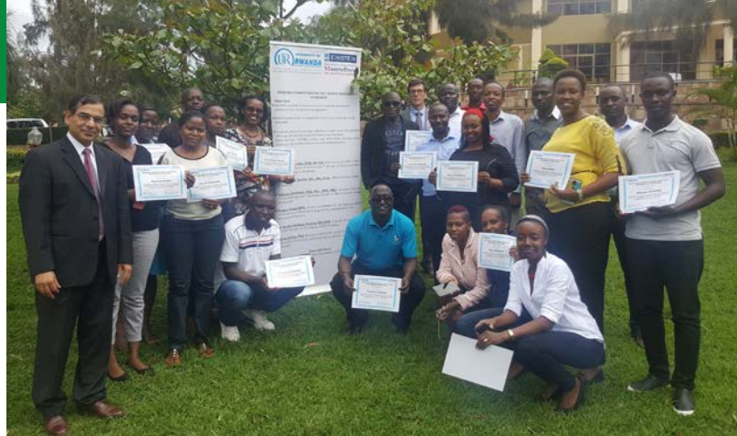
Researchers from the University of Rwanda at a research administration and grants management workshop in Kigali. The Fogarty-funded project focuses on enhancing HIV research training capacity.

However, those who left a lower-income country to study and work in the U.S. or other high-income countries find the balance between "brain drain" and "brain circulation"—or the collaboration of diaspora scientists with those in their country of origin—challenging. They know that while their careers benefited from relocating, the research capacity in their home country may have suffered.