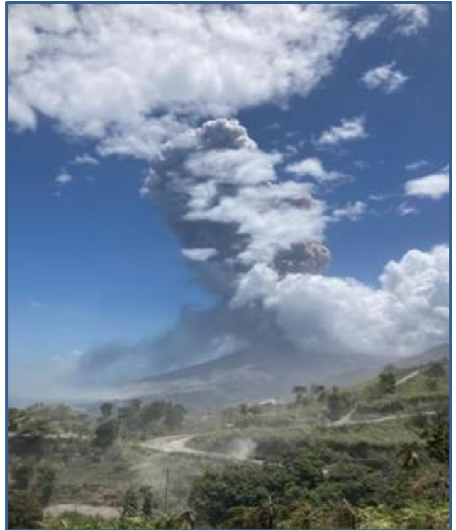
Eruption plume from the April 22, 2021 11:09am vulcanian explosion at La Soufriere Volcano. The lingering ash cloud from a pyroclastic density current that went towards the west is still visible above the western flank of the volcano.