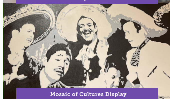
Mosaic of Cultures Display