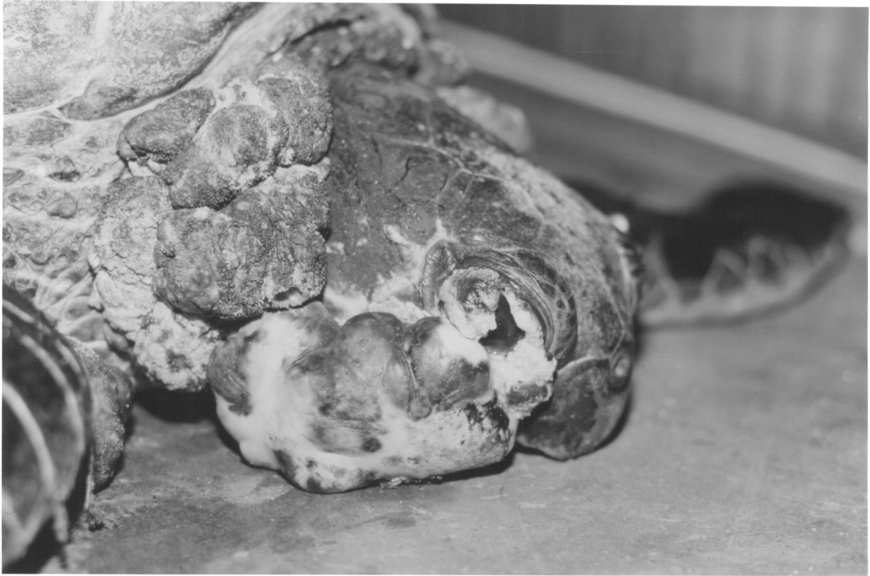
Figure 2.--Hawaiian green turtle severely afflicted with fibropapillomas.