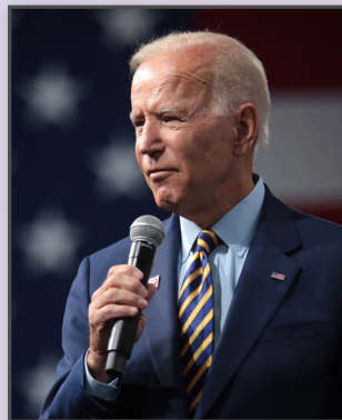
Joe Biden U.S. President