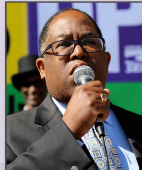
Mark Ridley-Thomas Los Angeles City Council District 10