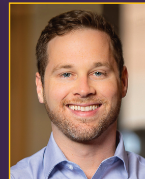
KIPP MUELLER California State Senate District 21