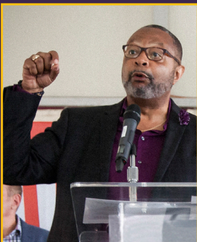
REGGIE JONES-SAWYER California State Assembly District 59