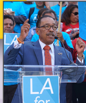
Herb Wesson Los Angeles County Board of Supervisors District 2