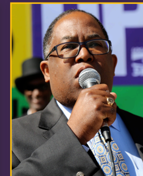
MARK RIDLEY-THOMAS Los Angeles City Council District 10