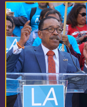
HERB WESSON Los Angeles County Board of Supervisors District 2