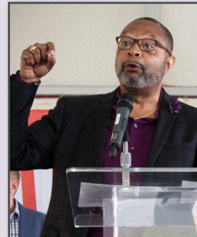
Reggie Jones-Sawyer California State Assembly District 59