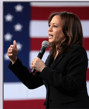
Kamala Harris U.S. Vice President