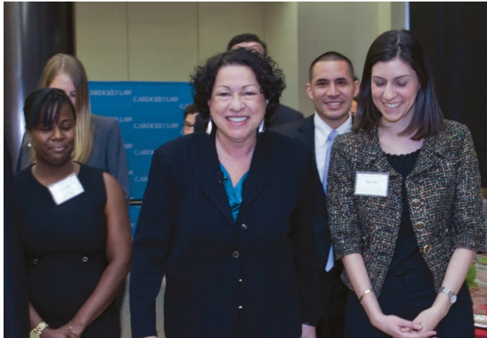
Supreme Court Justice Sonia Sotomayor participated in a conversation with students at the school.

Students with a keen interest in the Constitution find inspiration in the many events hosted by the center, including speaking engagements and conferences. Recent convenings have addressed hate speech and the culture wars, civil liberties in the age of terrorism and taxing the church.