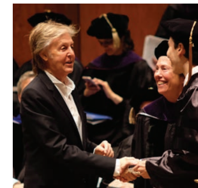
Sir Paul McCartney received the International Advocate for Peace Award from the Cardozo Journal of Conflict Resolution.