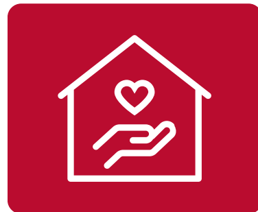
Nonprofit Organization Management