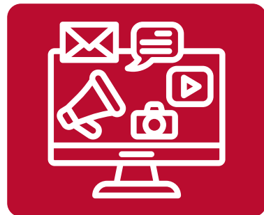
Marketing and Advertising