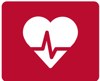
Hospitals and Health Care